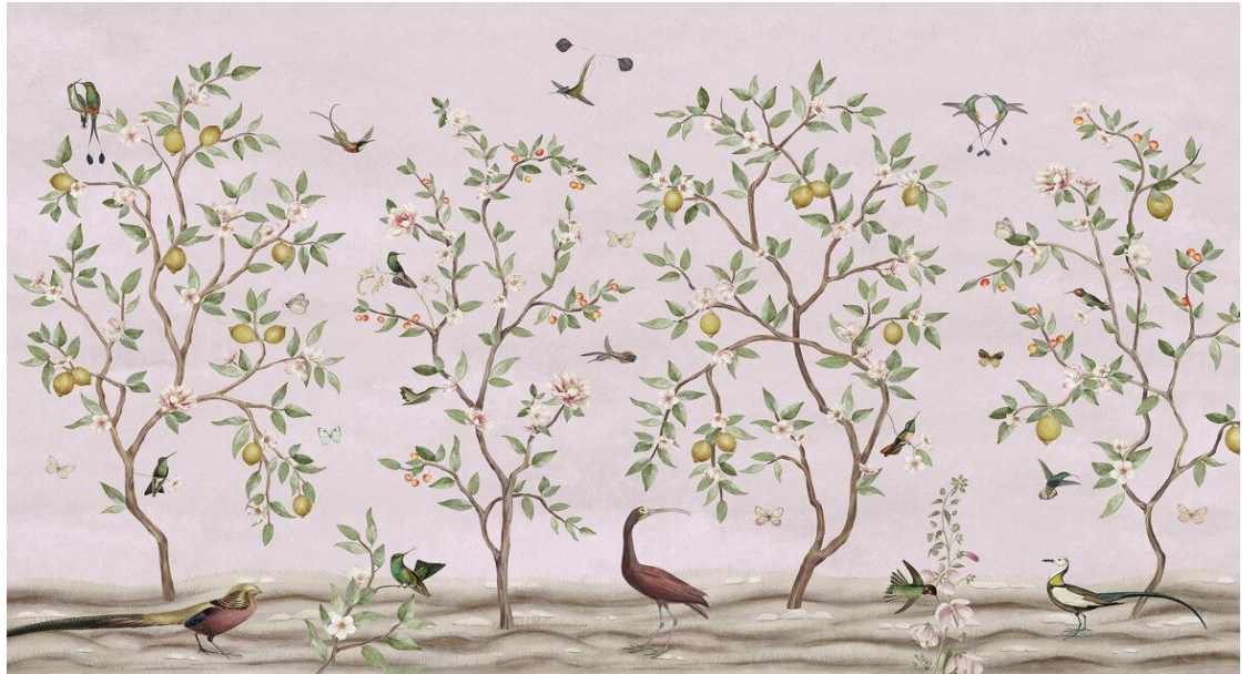
Artwork Credit: Photowall

The goal of this project is to infuse chinoiserie with a contemporary twist, breathing new life into this timeless aesthetic and pushing the boundaries of its expression.